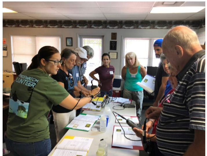
RRC members learn water testing at Florida Springs Institute

Dunnellon's second application for FRDAP funding of the Blue Run Park bathroom was turned down, causing another delay in building a much needed facility for the tuber season.