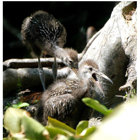
Reducing nitrates will allow these baby Limpkins to continue to flourish in the Rainbow River

On June 29 th the FDEP adopted 13 BMAPs to affect 24 Outstanding Florida Springs, one of them being the Silver/Rainbow BMAP. In 2015 FDEP had adopted a BMAP for the Rainbow alone with the stated goal of reducing nitrate levels in the Rainbow River by 30% in the first 5 years. Well, three years went by and nitrates continued to climb to 2.6 mg/L. Now we have a re-start with the same goals, an 82% nitrate reduction in 20 years. The trouble here is that there are no teeth in the BMAPs. They rely mainly on voluntary compliance with nitrate reduction goals. For instance, in the Rainbow recharge basin agricultural practices contribute 54% of the nitrates and voluntary Best Management Practices (BMPs) are the only management tool. This is our most serious environmental problem and the state is using a fly swatter to attack the elephant in the room.