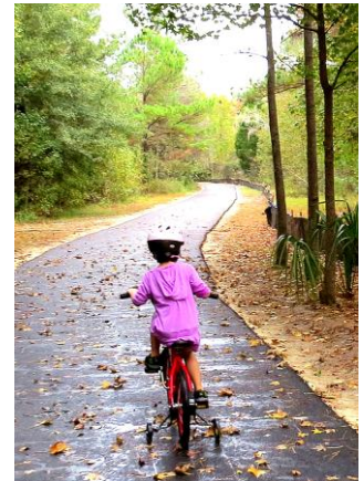
Enjoying the trail in Blue Run Park

Last spring the 2.5 mile trail extension across the Withlacoochee River opened for bike and hike use. It is expected that this trail will soon be connected at its southern end to the Withlacoochee State Trail in Citrus County and at its eastern end to the Marjorie Harris Carr Cross Florida Greenway. Last month the City of Dunnellon completed a paved trail spur parallel to the Rainbow River between the Withlacoochee trail extension and the Blue Run Park parking lot on CR 484. This fulfills part of the vision RRC had when planning the acquisition and development of this park. Many recreationists are now enjoying this trail spur.