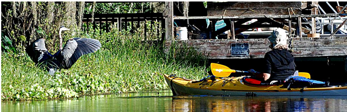
Kayaking on the Rainbow River yields many wildlife viewing opportunities