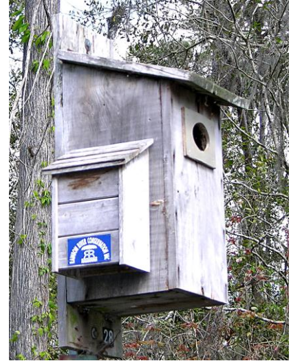
One of 49 wood duck boxes on the Rainbow

RRC will have its education booth stationed at the Manatee Festival at Three Sisters Springs January 19 th . Members will be seeking to have visitors sign the Water and Land Legacy petition at the festival. This is a petition for a constitutional amendment in the 2014 election cycle to dedicate 1/3 of existing doc stamp revenue to acquiring and protecting sensitive land and water resources in the state. This petition drive is the initiative of Senator Bob Graham's Conservation Coalition.