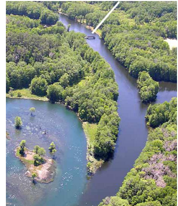
Future site of new trail bridge across Withlacoochee River

Construction has finally started on the trail which will bridge the Withlacoochee River. This section of the trail will run from a trail head at the Dunnellon Little League Complex, west along the southern edge of the Blue Run Park, south along the old railroad right-of-way, across a new bridge spanning the river, and south to a trail head on CR 39 in Citrus County. This three mile section of the trail, including the bridge, is expected to be completed in about six months.