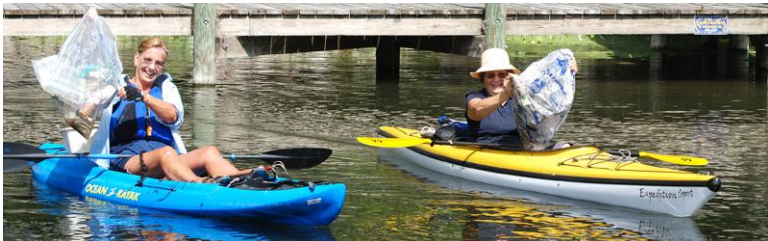
Cleaning the Rainbow River by kayak

For a location map please see the RRC website at www.RainbowRiverConservation.com . Those who participated last year will be called. New volunteers should call Jerry Rogers at 352-489-4648. Come out and enjoy a fun event.