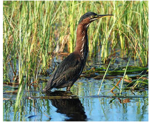
Green Heron at river edge

The Department of Environmental Protection has just completed a draft report on the Total Maximum Daily Load (TMDL) of nitrates in the Rainbow River. A copy has been posted on our website. A Basin Management Action Plan (BMAP) will follow which defines means to lower the river nitrate levels and contribute to restoration of good health to the river and its natural state. This will most likely address the deposit of fertilizers and waste water in the springs recharge basin. This effort will be paralleled by the RRC supported work of Dr. Bob Knight to derive a Rainbow River Restoration Plan. This overall plan will not only address the effect of reduced flows and high nitrates but will also include consideration of impacts of various forms of recreation on the river. Data gathered by the UF study of recreation and vegetation impacts as well as the recently completed SWFWMD vegetation mapping study will assist in the derivation of the restoration plan.