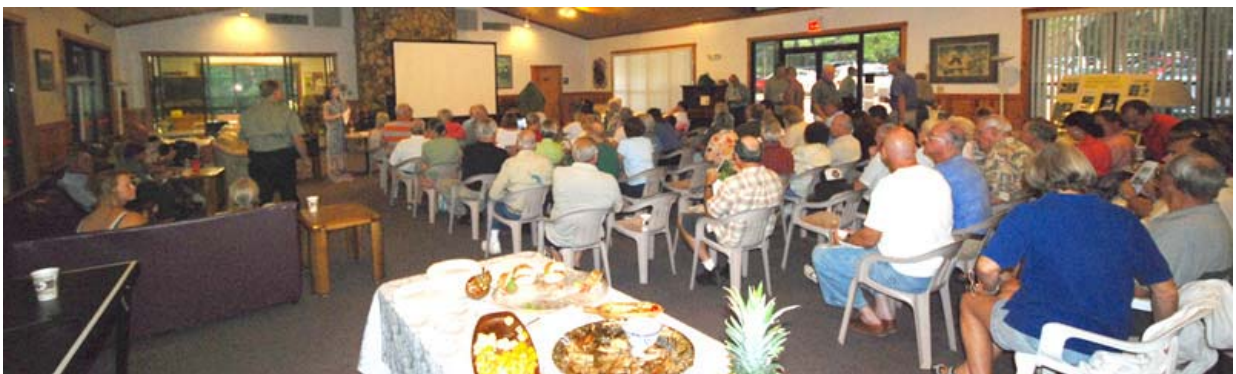
Standing Room Only at the Springs Protection and Land Use Ordinance Forum held on Oct. 12, 2009