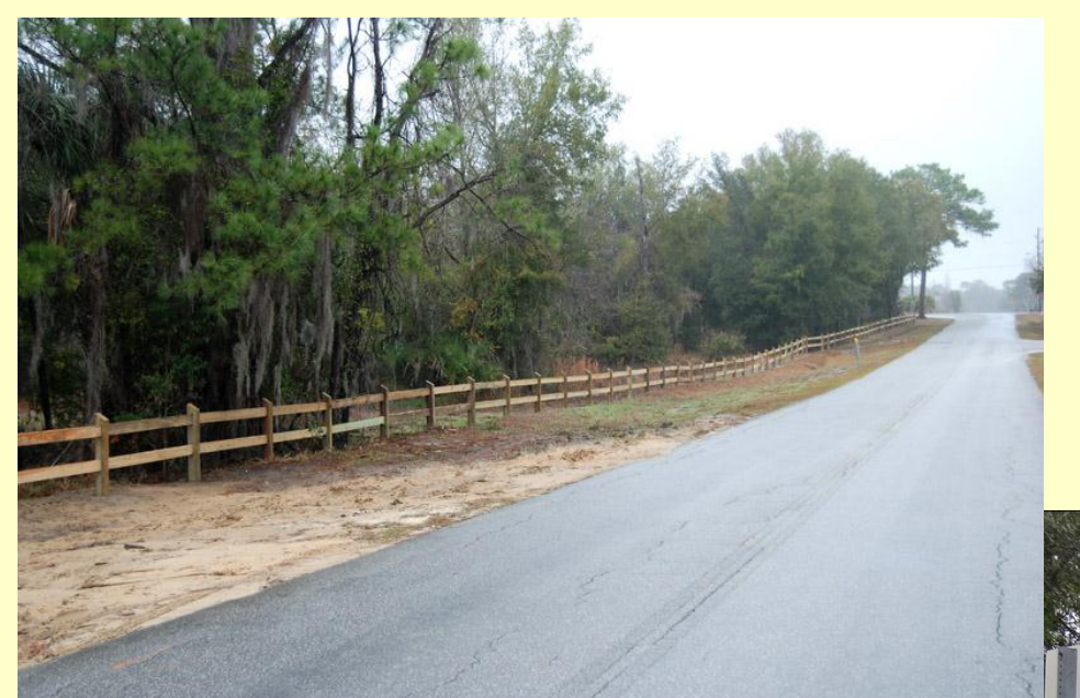
Two rail fence around park perimeter