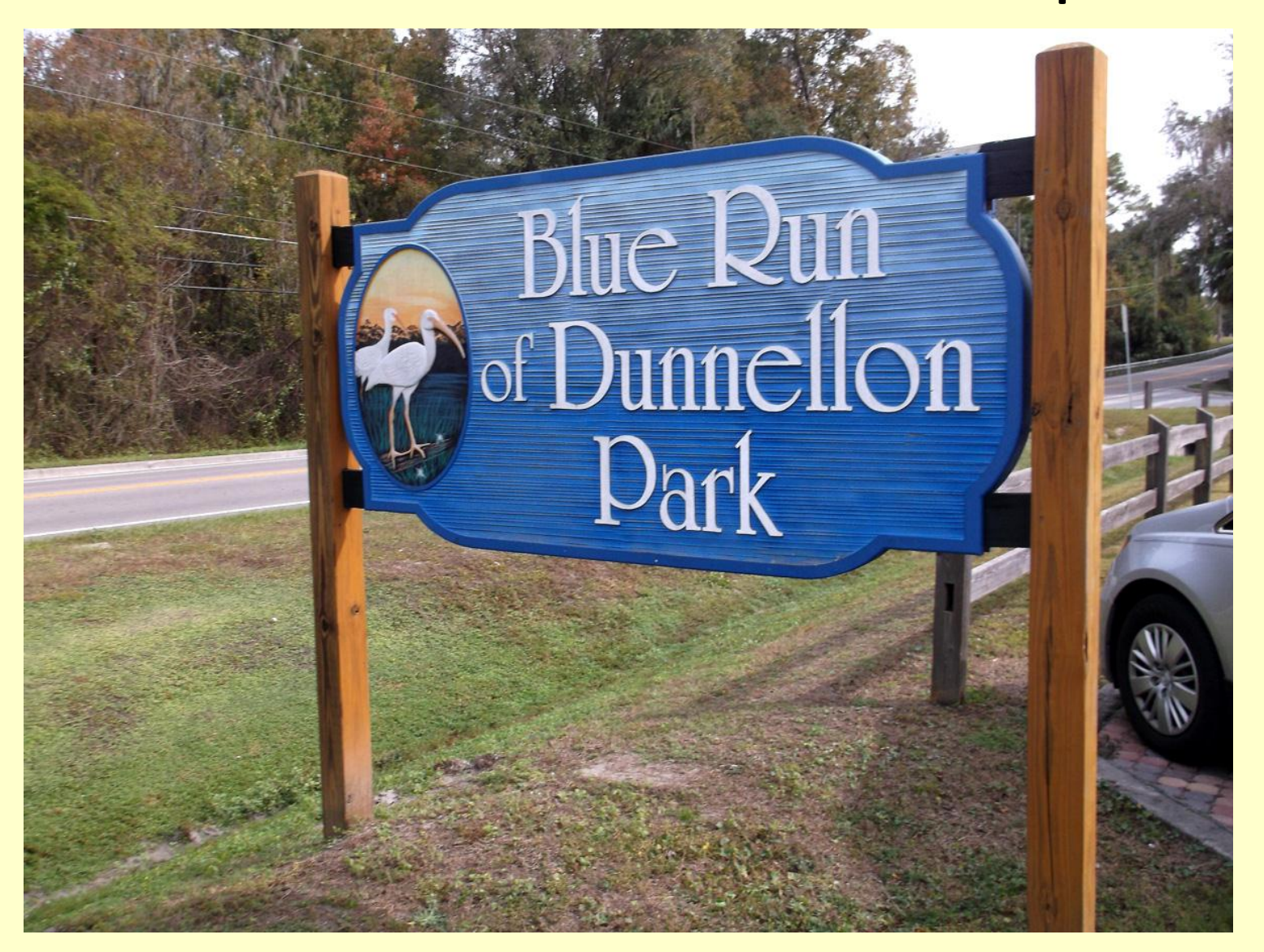
Bill Vibbert - December 2015