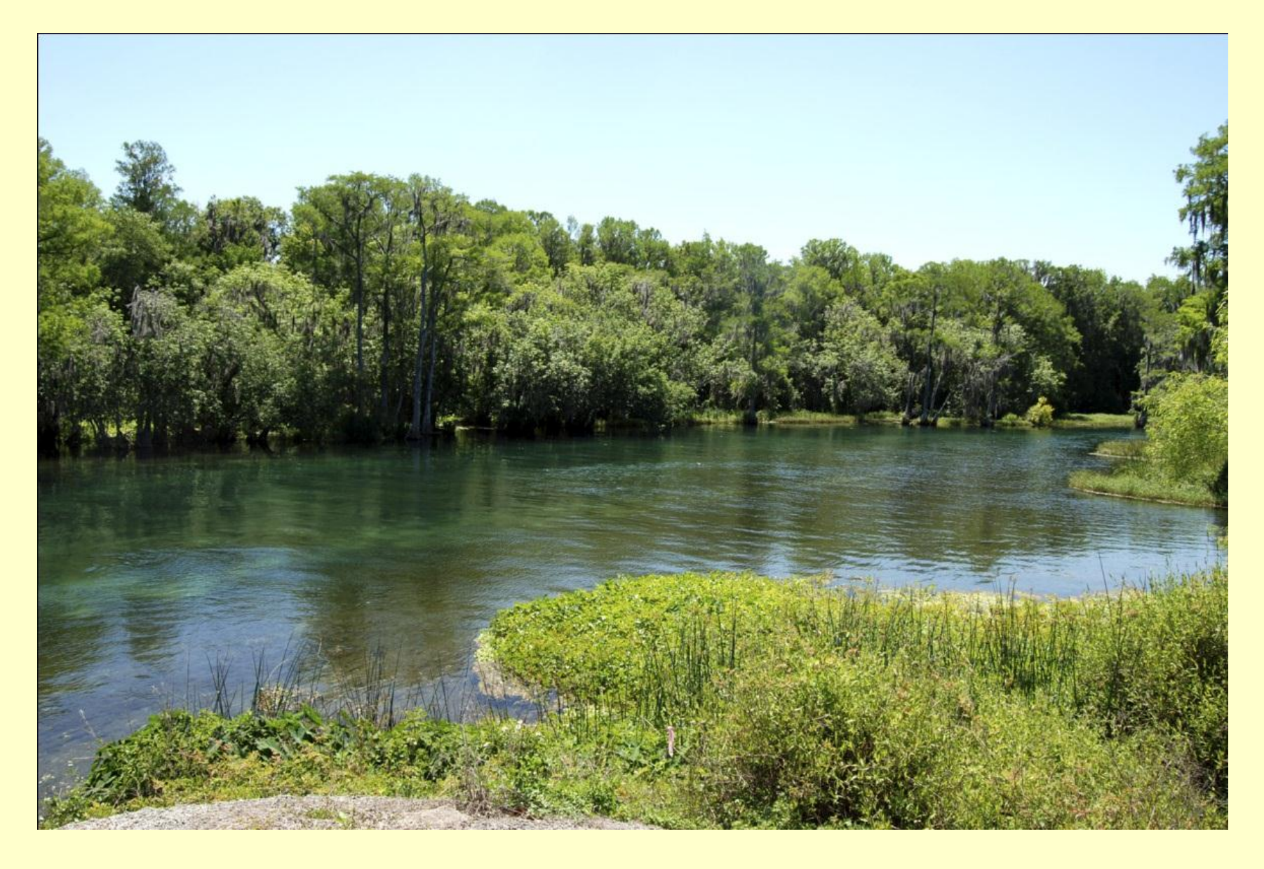
Blue Run Park has 1,300 feet of pristine wetlands along the Rainbow River