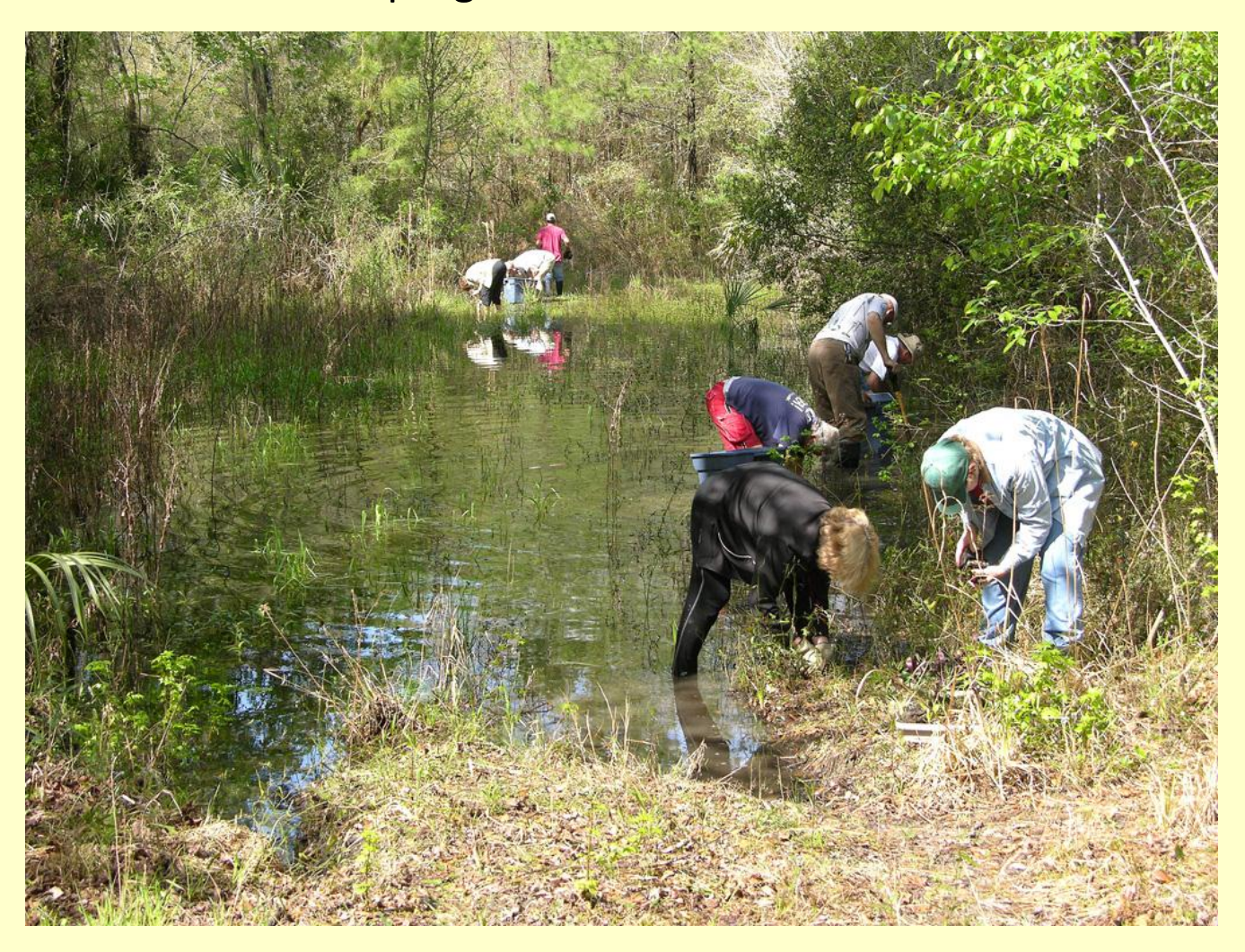
RRC volunteers supporting Aquatic Preserve Manager by planting aquatic vegetation

Rainbow River Conservation has adopted the Blue Run of Dunnellon Park and will continue to join other partners to improve the facilities, natural resources and education programs.