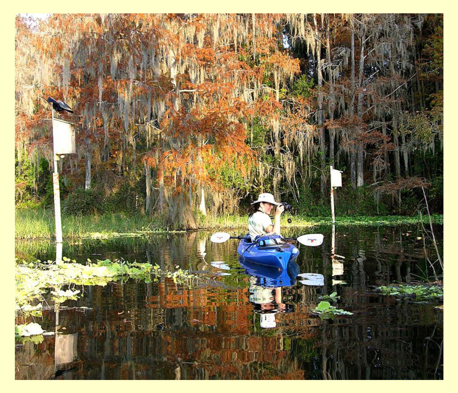
Blue Run Park protects the forest corridor, enhances wildlife habitat and encourages low-impact recreation