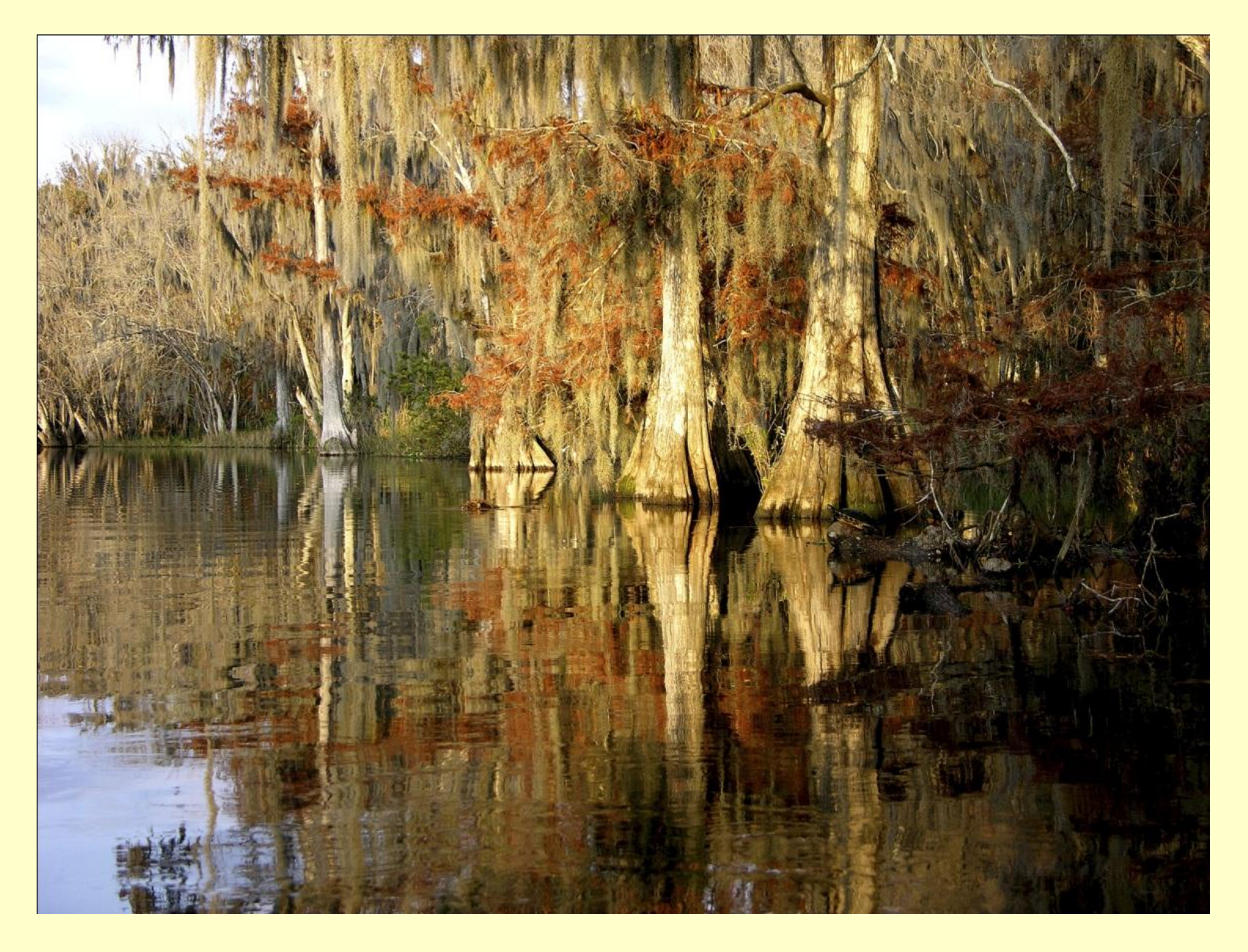
Giant Cypress trees line the edge of Blue Run of Dunnellon Park