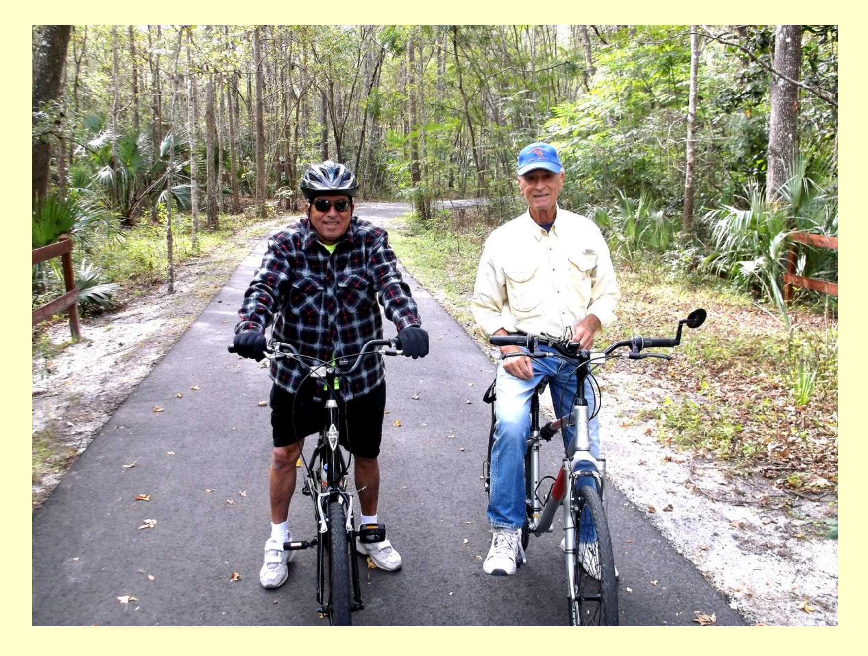
New friends are made while riding the trail