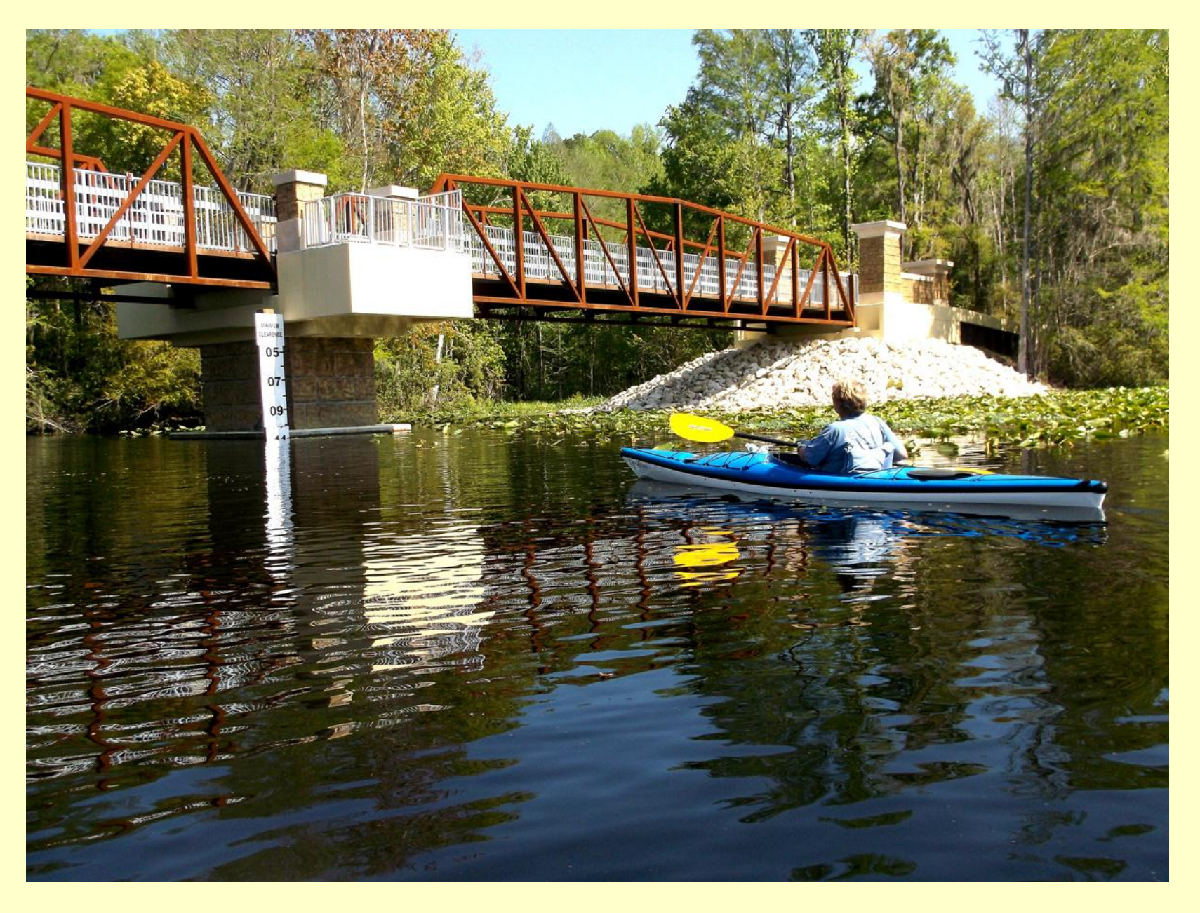
Kayak and bike trails converge at the Dunnellon Trail Bridge next to Blue Run Park