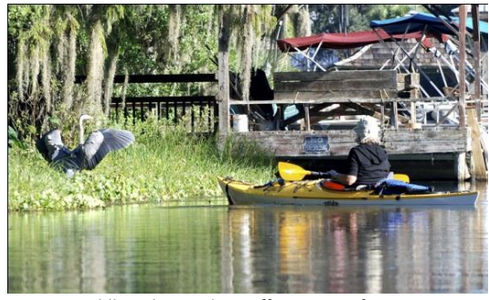
Paddling the Rainbow offers views of nature