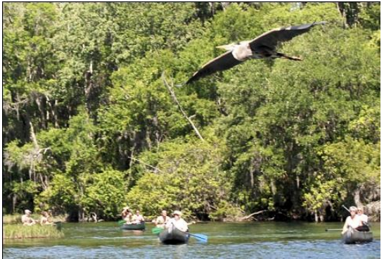
Rental canoes and kayaks are available from parks and outfitters