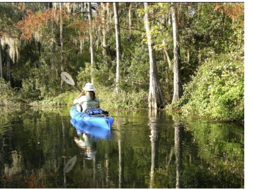
Paddling on a quiet morning