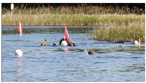
Stay within 100 feet of a dive flag, closer is better