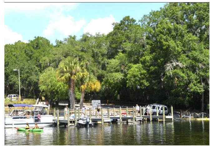
K P Hole Boat Ramp