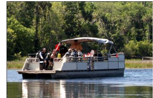
Drop divers off in rock-bottomed area only

Drop divers off in rock-bottomed areas only, because divers tend to stand on the bottom while waiting for the rest of their group to get into the water. Keep float lines taut in the rapidly changing river depths to avoid entanglement in vegetation, root systems and submerged branches.