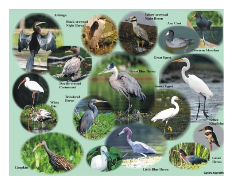
Birds of the Rainbow River

• Use binoculars to observe nesting or resting birds from a distance to avoid disturbing them. Do not use recordings to attract birds. Sit or crouch to appear smaller. Move slowly and steadily rather than quickly and sporadically.