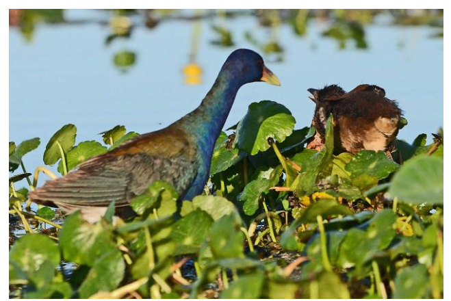
Purple Gallinule and chick in wetland vegetation

The Multi-use Corridors of Regional Economic Significance Program recently approved by the legislature and governor is highly controversial. These are planned limited access highways (toll roads) that will run through rural areas while crossing rivers and spring sheds and cutting through hundreds of miles of woods and wildlife refuges. It is being promoted as a boon to the Florida economy as well as "protecting or enhancing wildlife corridors and sensitive areas and primary springs protection zones". Putting high speed highways in wetlands and water bodies does not enhance wildlife corridors. The Sierra Club, Florida Conservation Voters, Progress Florida, Center for Biological Diversity, Save the Manatee Club, Conservancy of Southwest Florida, and the Florida Springs Council have all banded together to join the "No Roads to Ruin" Coalition in an effort to stop this travesty.