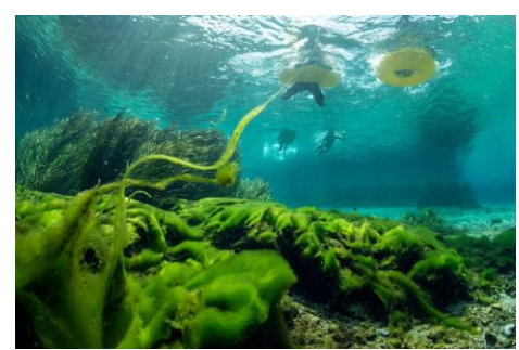
Spirogyra on river bottom

Due to the extraordinary rainfall this year the river water level is very high. This has had varied secondary affects. With high water there are fewer engine propeller scars form power boats trolling in shallow water. However, one also sees fewer water bird feeding at the edge of the river since the water is too deep. Dissolved nitrogen continues to grow and encourages algae growth and the presence of Spirogyra, a light green mat that covers vegetation and the river bottom is now present year-round.