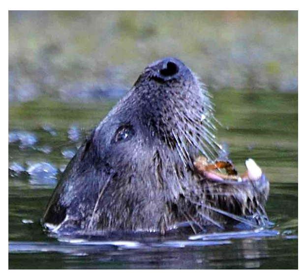
Otter eating a crayfish

Rainbow River Conservation was recently recognized for our transparency with a 2018 Gold Seal on our GuideStar Nonprofit Profile! GuideStar is the world's largest source of information on nonprofit organizations. More than 8 million visitors per year and a network of 200+ partners use GuideStar data to grow support for nonprofits. In order to get the 2018 Gold Seal, Rainbow River Conservation shared important information with the public using our profile on <a href="https://www.guidestar.org">www.guidestar.org</a>. Now our community members and potential donors can find in-depth information about our goals, strategies, capabilities, and progress. We're shining a spotlight on the difference we help make in the world.