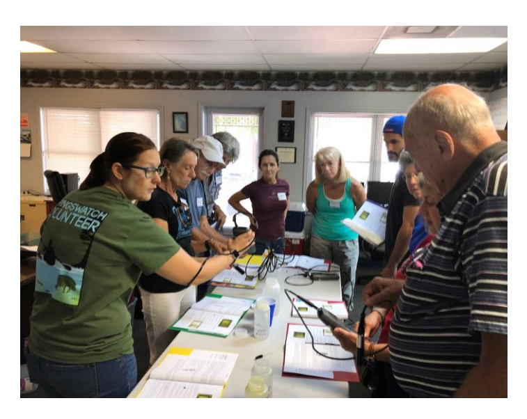
RRC members learn water testing at Florida Springs Institute

Rainbow River Conservation Inc., P.O. Box 729, Dunnellon, FL 34430