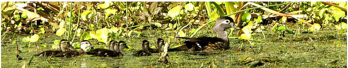
Wood duck female with chicks in the safety of the emergent vegetation along the Rainbow River