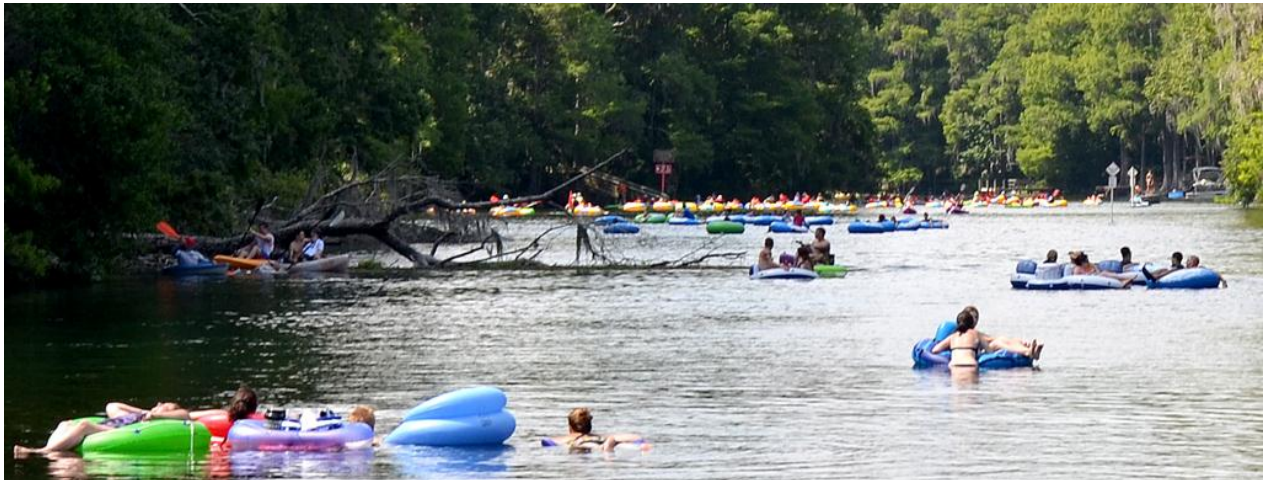
Tubers floating down the Rainbow River on a May weekend. Crowds grow larger on summer weekends.

One of the problems on the river is the enormous number of tubers on the summer weekends. Motorboats, in an effort to avoid the tubers, often move into shallow areas and tear up the natural vegetation which provides habitation for the aquatic life. This is particularly bad when tubers tie themselves together in large groups while floating down the river. The City of Dunnellon, within its area of jurisdiction, has an ordinance which disallows this grouping of tubers while the County does not have such a restriction. Some resolution between the two jurisdictions needs to be found with regard to river ordinances.