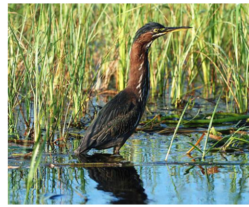
Green Heron at river edge

The Department of Environmental Protection has just completed a draft report on the Total Maximum Daily Load (TMDL) of nitrates in the Rainbow River. A copy has been posted on our website. A Basin Management Action Plan (BMAP) will follow which defines means to lower the river nitrate levels and contribute to restoration of good health to the river and its natural state. This will most likely address the deposit of fertilizers and waste water in the springs recharge basin. This effort will be paralleled by the RRC supported work of Dr. Bob Knight to derive a Rainbow River Restoration Plan. This overall plan will not only address the effect of reduced flows and high nitrates but will also include consideration of impacts of various forms of recreation on the river. Data gathered by the UF study of recreation and vegetation impacts as well as the recently completed SWFWMD vegetation mapping study will assist in the derivation of the restoration plan.